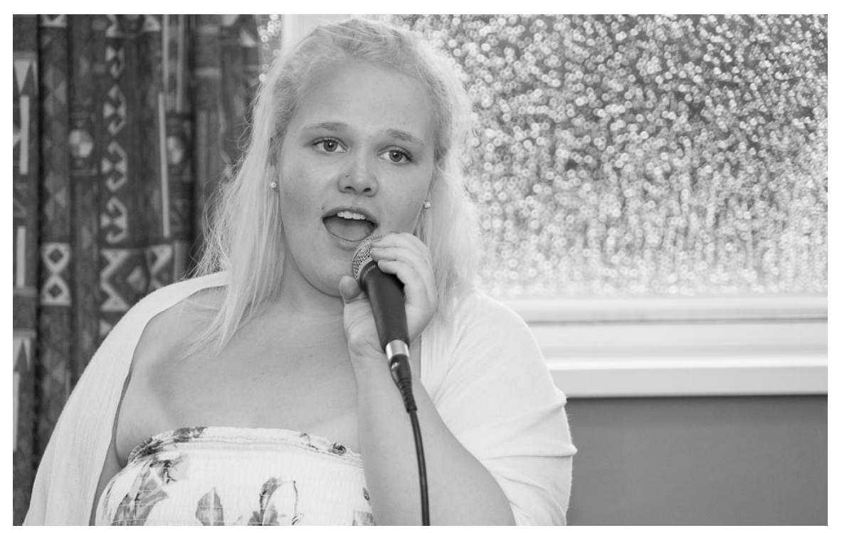
Young vocalist at a Rock Up session.

At the end of each term, the Project Officer held a review and reflection session with the tutors, using the Youth Music 'Do, Review, Improve' framework to consider the sessions. This provides an objective means of considering the sessions from all angles, and identifying areas that may be developed.