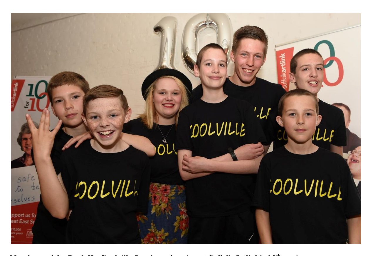
Members of the Rock Up Coolville Band, performing at Suffolk Artlink's 10^{\rm th} anniversary celebrations.

"I couldn't have done this without the tutors, it's been everything to me." Rock Up participant