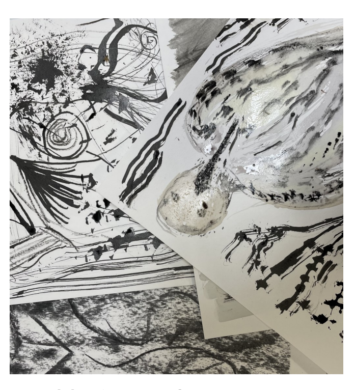
Sound drawing examples

Close your eyes and listen for 5 minutes. Pick out the different sounds that you hear.