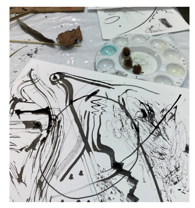
Marks made with foraged items like sticks, leaves and grass

Start to make marks using your different drawing tools, use different marks and different tools to represent the different sounds that you can hear. See how the Charcoal and Ink make different textures on the paper. Fill your page with your new marks. Think about how to make a mark that represents something far away or quiet, how would this mark differ from something loud and close. Think about repeating marks for rhythm. How would a mark representing birdsong differ from the sound a motorbike makes?