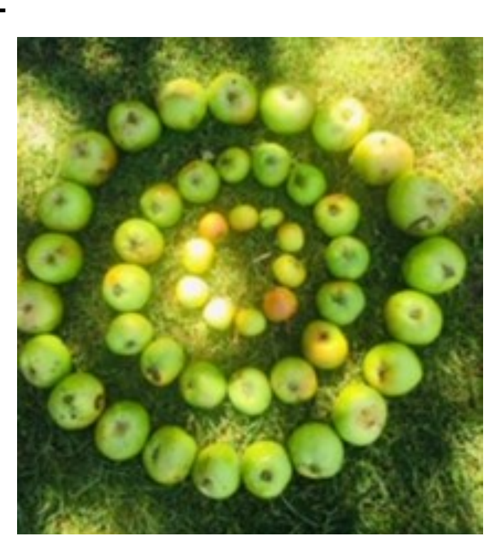
Celebrating windfalls

This is such a plentiful time of year that arranging the fruits and vegetables does not feel like a waste. On the contrary, it's like a celebration of their beauty and value - it's a way of saying thank you to the land.