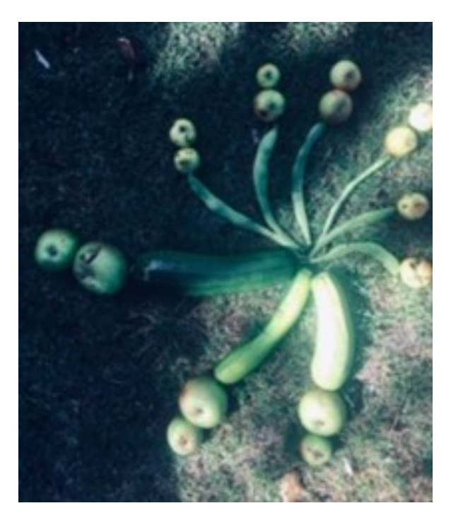
Courgette and apple flower. Photo by the artist

Don't forget to send us photos of your land art so that we can share them with everyone on our blog site.