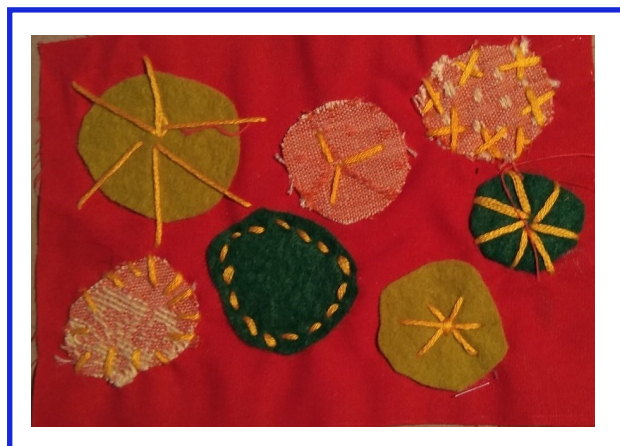
Shelly's textile autumn leaves