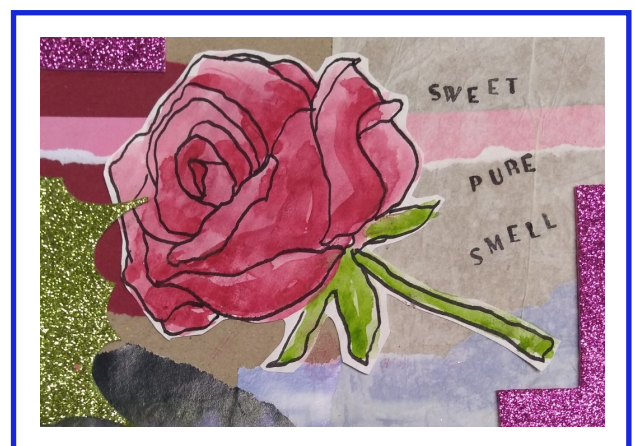
The last of Kate's summer roses