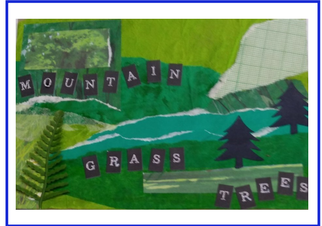
Caitlin's celebration of green