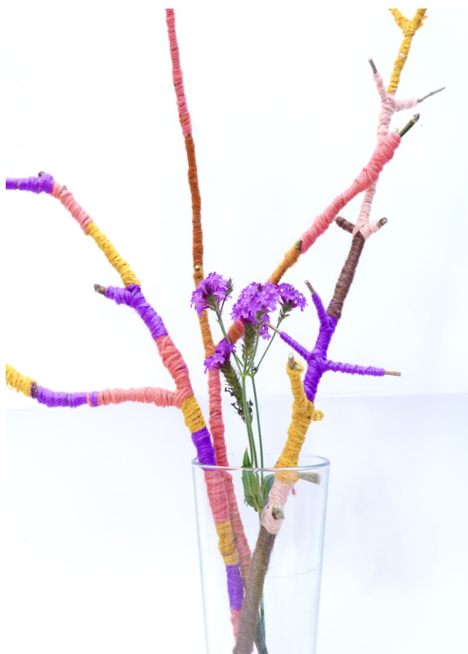
Yarn wrapped twigs in vase